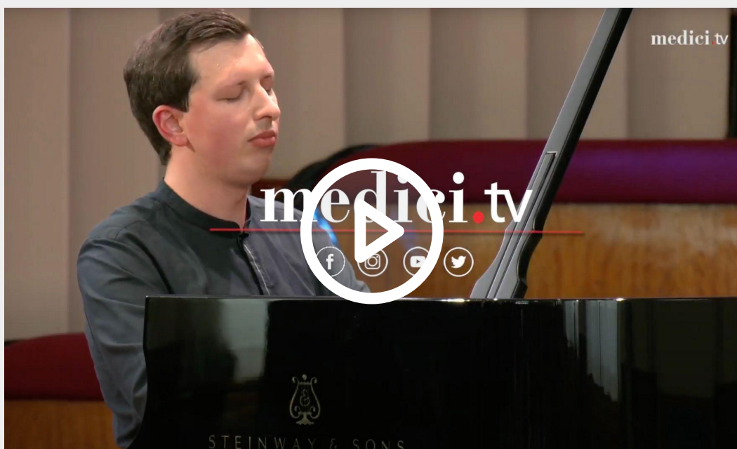
Franz Liszt: Années de pèlerinage, première année – Suisse, S160